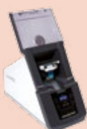
Minilys for personal use