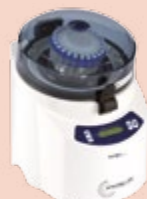
Precellys® 24 for high throughput