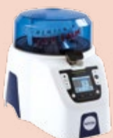
Precellys® Evolution Super Homogenizer