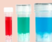
Lysing kits consumables