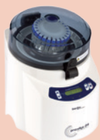
Precellys® 24 for high throughput