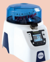
Precellys® Evolution Super Homogenizer