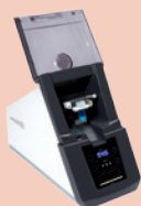
MinilyS for personal use