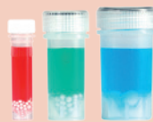
Lysing kits consumables